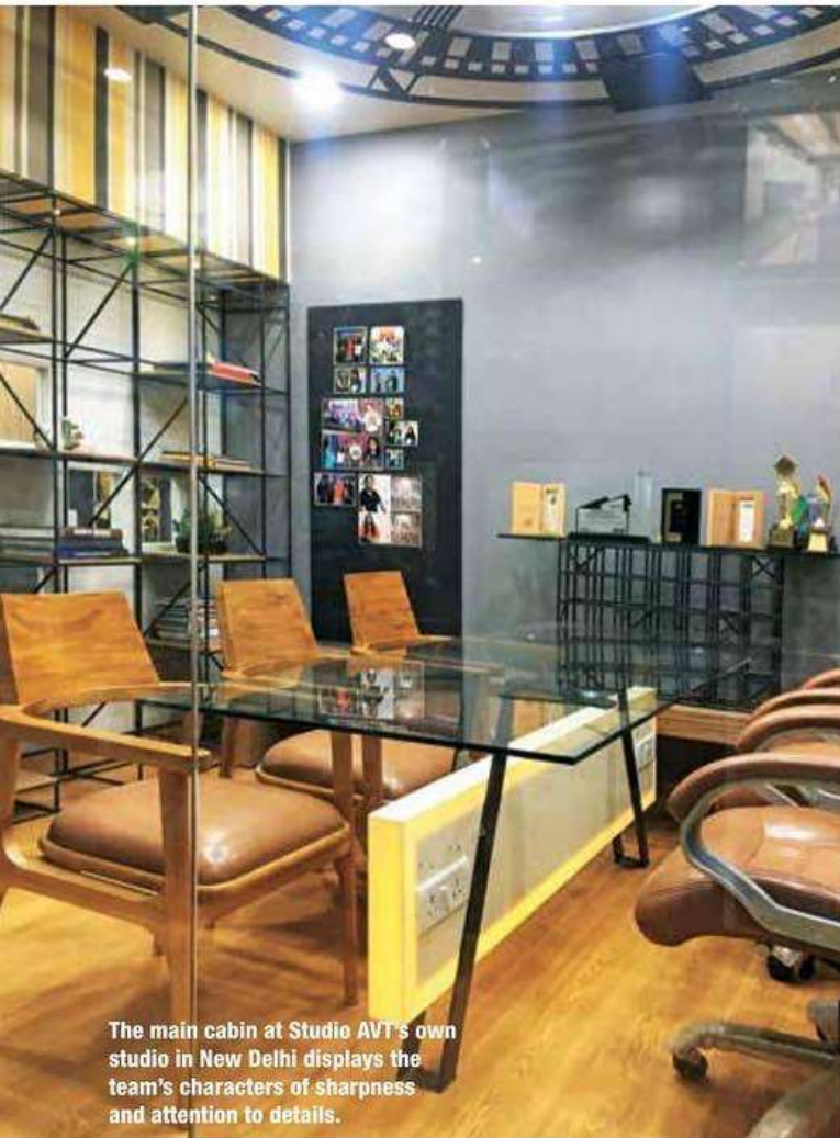
The main cabin at Studio AVT's own studio in New Delhi displays the team's characters of sharpness and attention to details.