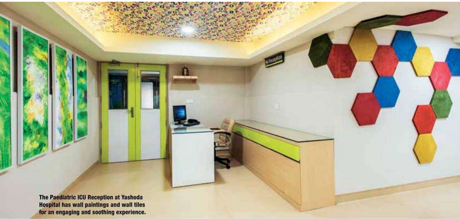
The Paediatric ICU Reception at Yashoda Hospital has wall paintings and wall tiles for an engaging and soothing experience.