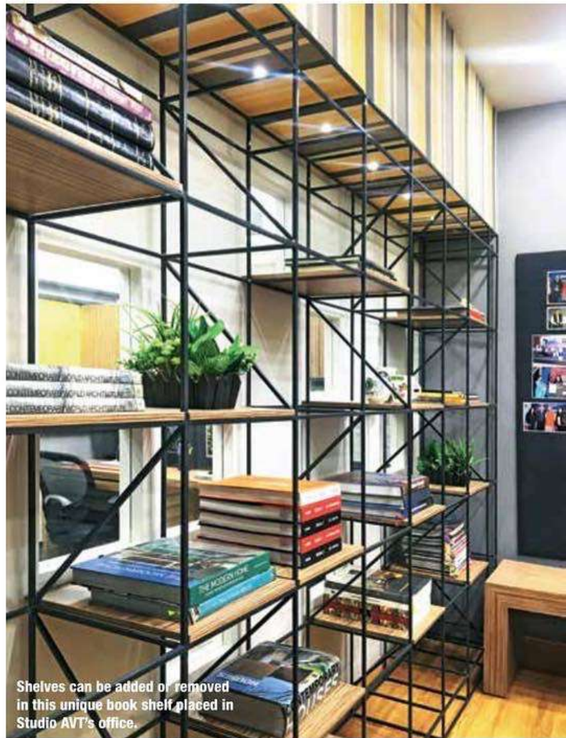
Shelves can be added or removed in this unique book shelf placed in Studio AVT's office.

or structures, I find Centre Pompidou in Paris by Richard Rogers extremely inspiring.