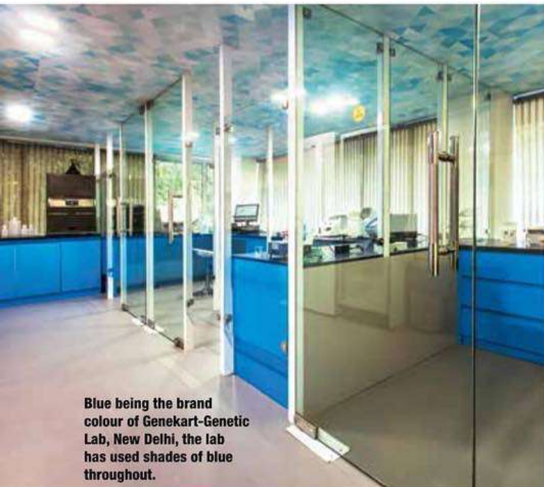
Blue being the brand colour of Genekart-Genetic Lab, New Delhi, the lab has used shades of blue throughout.

Studio AVT was born in 2011 in Delhi. A simple desire to make a name in the game and a shared compassion towards people and our surroundings led us into this overly satisfying entrepreneurial journey. With an intense desire to change spaces for the better, we continuously push ourselves to do justice to this profession. Both of us worked for two years after graduating from design school before starting out on our own.