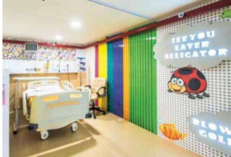
The PICU bed area in Yashoda Hospital, Ghaziabad, exhibits colourful bands that resonate youthfulness.