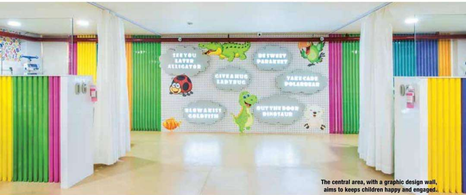
The central area, with a graphic design wall, aims to keep children happy and engaged.

and most graciously, the opening ceremony was inaugurated by Rajnath Singh, Home Minister of India.